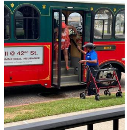
Galveston Island Transit –Cooling Bus

In the wake of the storm's severe impacts, many people were stranded in their homes, and numerous businesses remained closed. After three days of disruption, the Colorado Valley Transit Agency resumed operations, implementing alternate routes for their buses and partnering with the Red Cross to deliver water and aid to the community. Meanwhile, Galveston Island Transit (GIT) was called out to senior citizen homes and its buses were utilized as cooling centers for those that could not travel to cooling centers due to lack of electricity. For two weeks after the storm, GIT was called out six times to support local senior homes on the island, ensuring that vulnerable residents had access to much-needed cooling and comfort as temperatures reached over 100 degrees.