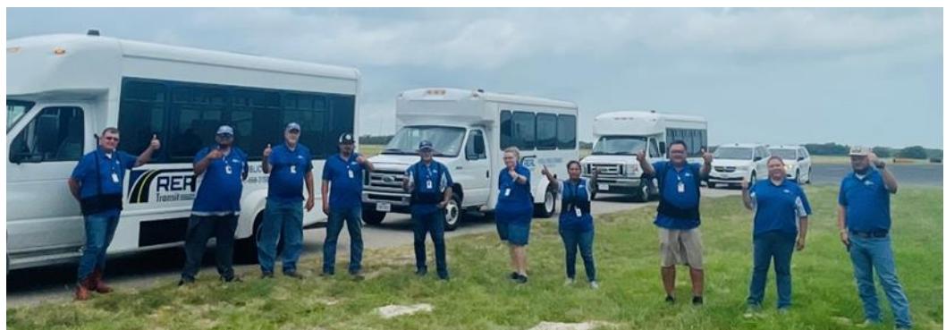
REAL Bus Drivers

Thank you to our coastal transit agencies!