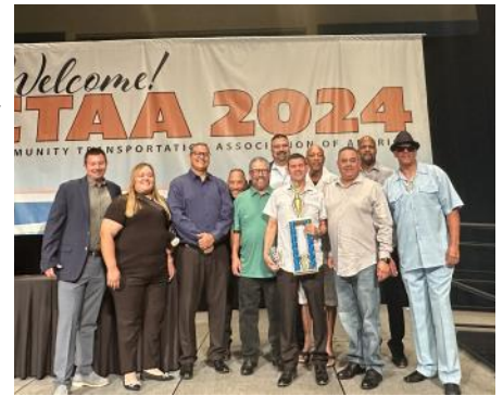
VIA Metro and CapMetro, Texas