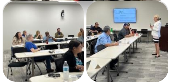
CARES Frontline Supervisor Certification Hosted by Alamo Area Council of Governments April 29-30, 2024