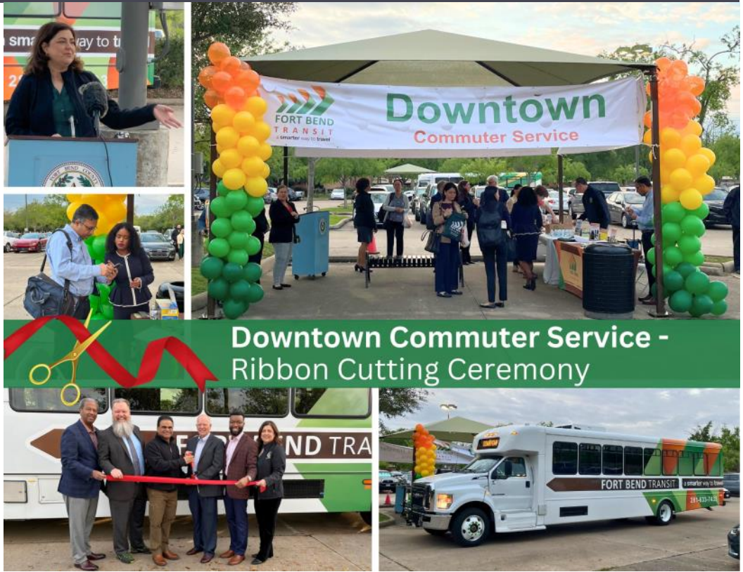
Downtown Commuter Service - Ribbon Cutting Ceremony

Fort Bend Transit marked a significant milestone as they celebrated the ribbon-cutting of their new Downtown Commuter service. They are deeply grateful to all who joined them and contributed to the success of their event.