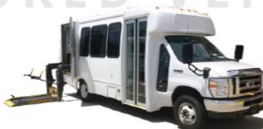
Elkhart Coach ECII