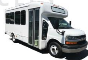
Gaval Universal II