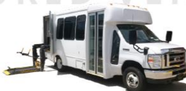
Elkhart Coach ECII