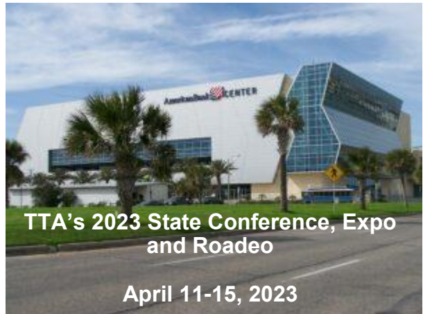
TTA's 2023 State Conference, Expo and Rodeo

Our 2023 Annual State Conference and Expo will feature industry-leading content, with timely general sessions, in-depth breakout sessions, and training. It will also have numerous networking opportunities with your friends and colleagues from the transit industry.