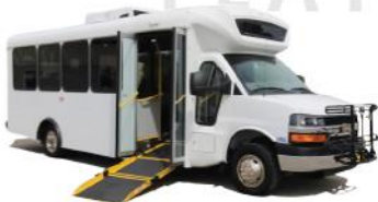
ARBOC Spirit of Mobility