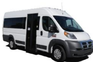
Lone Star ProMaster