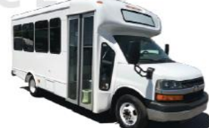
Gaval Universal II