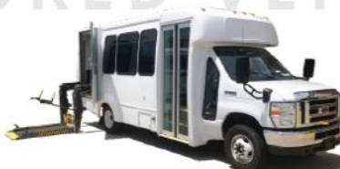
Elkhart Coach ECII