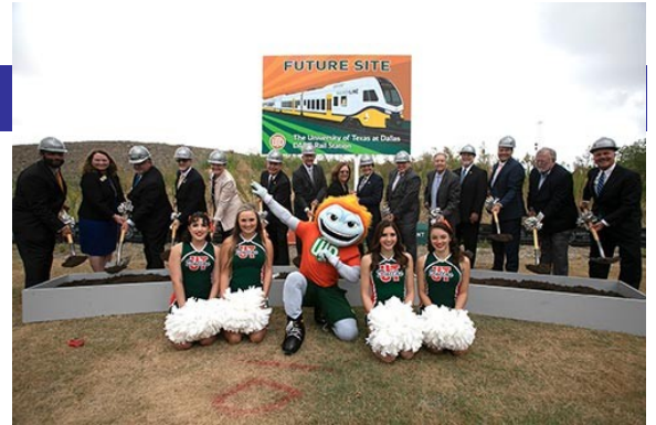
DART and local dignitaries break ground for the Silver Line on the spot of the future University of Texas at Dallas Station in Richardson.

Dallas Area Rapid Transit and local dignitaries broke ground during six ceremonies on Thursday, September 19, on the new 26-mile Silver Line regional rail service from Plano to DFW International Airport.