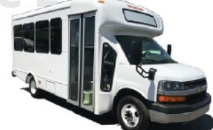
Gaval Universal II