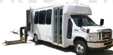
Elkhart Coach ECII