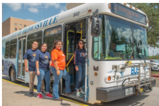
Texas Southmost College and Brownsville Metro are continuing to offer free transit services for STC students.